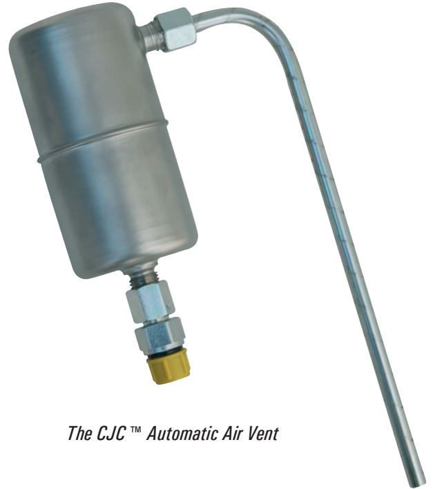
The CJC™ Automatic Air Vent