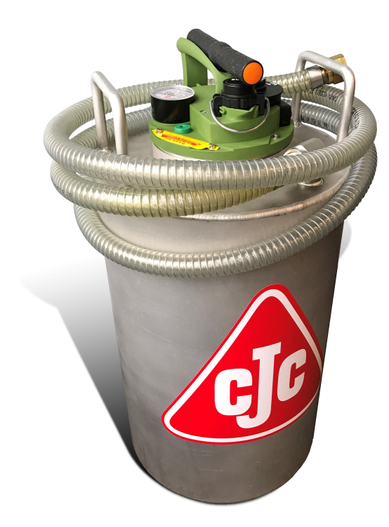
The CJC ™ Drain Tank Kit