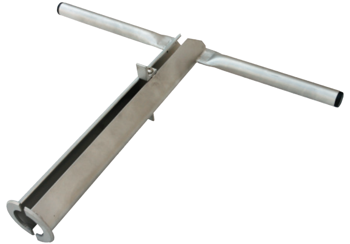
The CJC™ Filter Insert Extractor