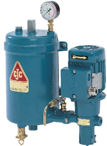
HDU 15/25 PV CJC Off-line Filter

The water absorption capacity of the cellulose element is up to 50% of the total contaminant holding capacity of 2 L.