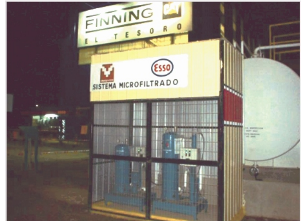
CJC Filters installed in Minera El Tesoro.

Filtration of 3 µm absolute. 0.8 µm nominal. Dirt holding capacity: 4 kg. Water absorption capacity: 2 L. Absorption of resin / oxidation deposit.