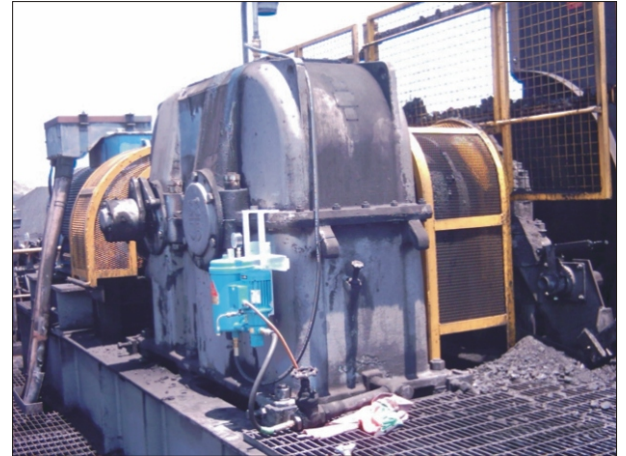
The CJC™ FineFilter HDU 15/25 at the Gear Box of BMA Coal Loading Terminal.

Upon start up a result of greater than ISO 22/22/17. The contamination in the oil was greatly reduced over a 42 day period. The ISO particle count on day 42 is 15/13/12.