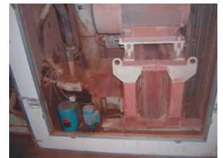
One of the 4 presses, type SITI MAGNUM.